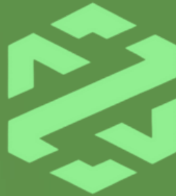
DEXTOOLS ( www.dextools.io )