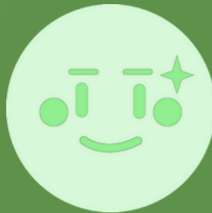
PINKSALE ( www.pinksale.finance )