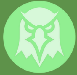
DEXSCREENER ( www.dexscreener.com )