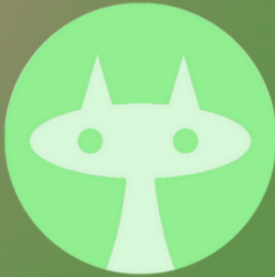
DEXVIEW ( www.dexview.com )