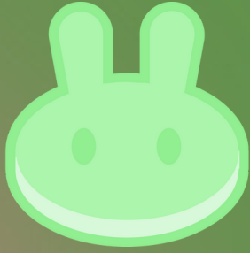
PANCAKESWAP ( www.pancakeswap.finance )